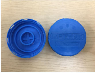
DN50 DIN11851 Disposable Cap (Blue) manufactured from PP Food safe and FDA material

Metano Limited. Units 14/15 Winfield Industrial Estate Rowlands Gill, Tyne & Wear, United Kingdom. NE39 1EH T: +44 (0) 01207 549 448 F: +44 (0) 01207 549 447 E: sales@metano.com W: www.metano.com