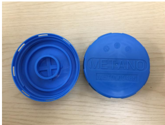
DN50 DIN11851 Disposable Cap (Blue) manufactured from PP Food safe and FDA material

Metano Limited. Units 14/15 Winfield Industrial Estate Rowlands Gill, Tyne & Wear, United Kingdom. NE39 1EH T: +44 (0) 01207 549 448 F: +44 (0) 01207 549 447 E: sales@metano.com W: www.metano.com