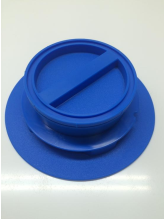
3" Discharge Gland Assembly (with cutter and membrane) Comprises of MET0000085 3" Gland (Blue) 3" BSP Internal Thread (Female) MET0000084 3" Crown Cutter (Blue). MET0000088 3" Blue Nitrile 'O' Ring 82.22mm x 2.62mm MET0000086 3" BSP Male Plug (Blue) MET0000267 Membrane Rolls LLDPE Laminate 112mu (BLUE)