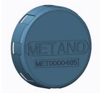
DN50 DIN11851 Disposable Cap (Blue) manufactured from PP Food safe and FDA material

Metano Limited. Units 14/15 Winfield Industrial Estate Rowlands Gill, Tyne & Wear, United Kingdom. NE39 1EH T: +44 (0) 01207 549 448 F: +44 (0) 01207 549 447 E: sales@metano.com W: www.metano.com