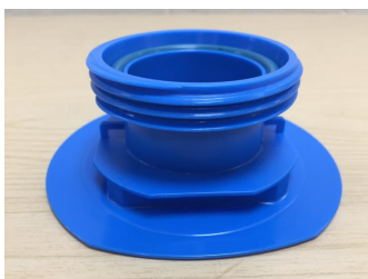
DN50 Gland (Blue) manufactured from LLDPE Food safe and FDA material