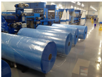
1% BLUE Tint 60mu LLDPE FILM 2200mm