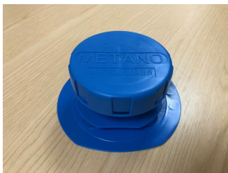
DN50 Gland Assembly - FILL