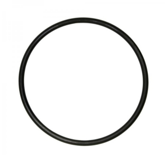
Blue FDA 'O' Ring 54 id x 5mm