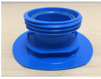
DN50 Gland (Blue) manufactured from LLDPE Food safe and FDA material