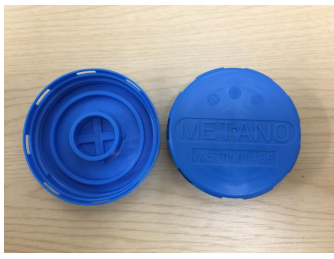
DN50 DIN11851 Disposable Cap (Blue)