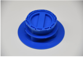
2" Gland Assembly - FILL

Metano Limited. Units 14/15 Winfield Industrial Estate Rowlands Gill, Tyne & Wear, United Kingdom. NE39 1EH T: +44 (0) 01207 549 448 F: +44 (0) 01207 549 447 E: sales@metano.com W: www.metano.com