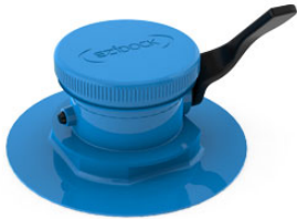
2" / S60 Disposable Butterfly Valve.

MET0000241 2" BSP Female Square Gland BLUE LLDPE