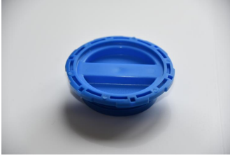
2" Blue Nitrile 'O' Ring 53.64mm x 2.62mm

Metano Limited. Units 14/15 Winfield Industrial Estate Rowlands Gill, Tyne & Wear, United Kingdom. NE39 1EH T: +44 (0) 01207 549 448 F: +44 (0) 01207 549 447 E: sales@metano.com W: www.metano.com