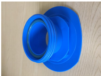
DN50 DIN11851 Disposable Square Gland (Blue) manufactured from LLDPE Food safe and FDA material