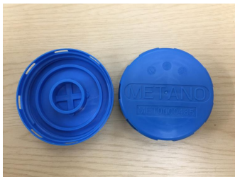
DN50 DIN11851 Disposable Cap (Blue) manufactured from PP Food safe and FDA material