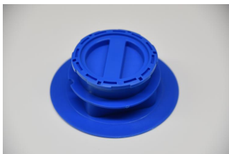
2" Gland Assembly - FILL