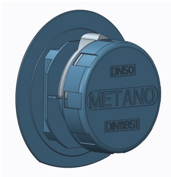
DN50 Disposable Butterfly Valve LLDPE Blue