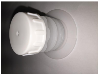
1 Inch Aseptic fill gland

Metano Limited. Units 14/15 Winfield Industrial Estate Rowlands Gill, Tyne & Wear, United Kingdom. NE39 1EH T: +44 (0) 01207 549 448 F: +44 (0) 01207 549 447 E: sales@metano.com W: www.metano.com