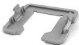
2" Combo Clip.

MET0000241 2" BSP Female Square Gland BLUE LLDPE