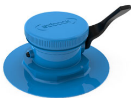
2" / S60 Disposable Butterfly Valve.

Metano Limited. Units 14/15 Winfield Industrial Estate Rowlands Gill, Tyne & Wear, United Kingdom. NE39 1EH T: +44 (0) 01207 549 448 F: +44 (0) 01207 549 447 E: sales@metano.com W: www.metano.com