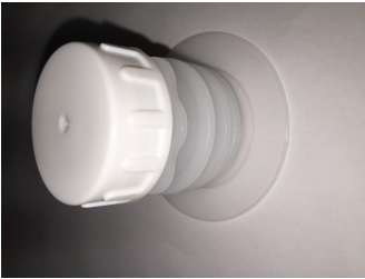
1 Inch Aseptic fill gland