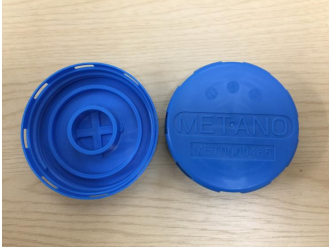
DN50 DIN11851 Disposable Cap (Blue) manufactured from PP Food safe and FDA material

Metano Limited. Units 14/15 Winfield Industrial Estate Rowlands Gill, Tyne & Wear, United Kingdom. NE39 1EH T: +44 (0) 01207 549 448 F: +44 (0) 01207 549 447 E: sales@metano.com W: www.metano.com