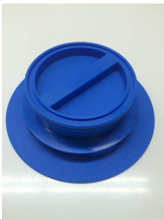
3" Discharge Gland Assembly (with cutter and membrane) Comprises of MET0000085 3" Gland (Blue) 3" BSP Internal Thread (Female) MET0000084 3" Crown Cutter (Blue). MET0000088 3" Blue Nitrile 'O' Ring 82.22mm x 2.62mm MET0000086 3" BSP Male Plug (Blue) MET0000267 Membrane Rolls LLDPE Laminate 112mu (BLUE)