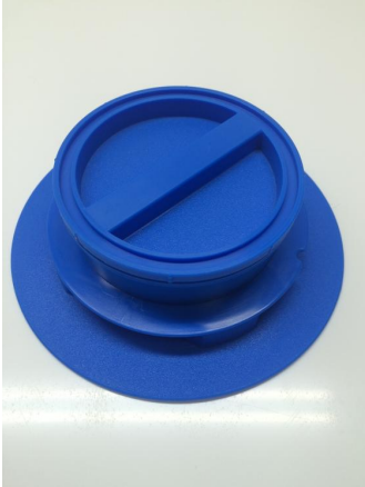
3" Discharge Gland Assembly (with cutter and membrane) Comprises of MET0000085 3" Gland (Blue) 3" BSP Internal Thread (Female) MET0000084 3" Crown Cutter (Blue). MET0000088 3" Blue Nitrile 'O' Ring 82.22mm x 2.62mm MET0000086 3" BSP Male Plug (Blue) MET0000267 Membrane Rolls LLDPE Laminate 112mu (BLUE)