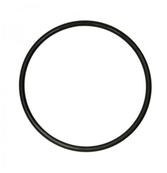
Blue FDA 'O' Ring 54 id x 5mm