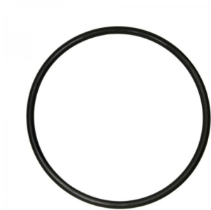
Blue FDA 'O' Ring 54 id x 5mm