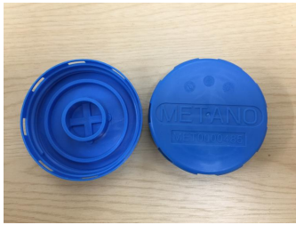
DN50 DIN11851 Disposable Cap (Blue)

Metano Limited. Units 14/15 Winfield Industrial Estate Rowlands Gill, Tyne & Wear, United Kingdom. NE39 1EH T: +44 (0) 01207 549 448 F: +44 (0) 01207 549 447 E: sales@metano.com W: www.metano.com