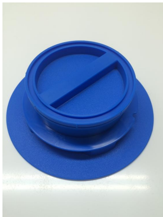
3" Gland Assembly - FILL Comprises of MET0000085 3" Gland (Blue) 3" BSP Internal Thread (Female) MET0000086 3" BSP Male Plug (Blue) MET0000088 3" Blue Nitrile 'O' Ring 82.22mm x 2.62mm