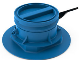
3" Disposable Butterfly Valve with External S100 Buttress Thread and internal 3 Inch BSP.