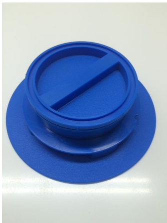
3" Gland Assembly - FILL Comprises of MET0000085 3" Gland (Blue) 3" BSP Internal Thread (Female) MET0000086 3" BSP Male Plug (Blue) MET0000088 3" Blue Nitrile 'O' Ring 82.22mm x 2.62mm