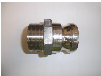
Metercube 2" BSP 2" Male Camlock Part F Stainless Steel