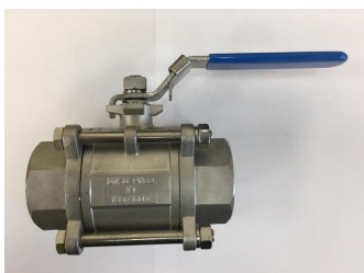
2" BSP full flow stainless steel 3 piece ball valve with PTFE seals