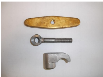
Metercube Swing Bolt Assembly Comprises of MET0000364 Metercube Lid Clamp MET0000363 Metercube Wingnut Brass MET0000362 Metercube Eyebolt M12 X 80 A2EB12080