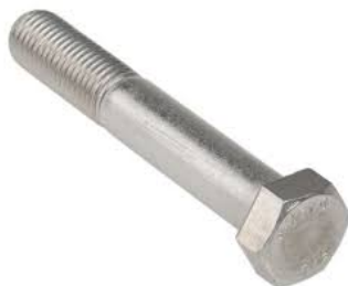
Metercube Lid Bolt