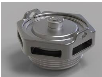
2" pre vac