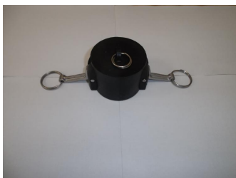
M3 PP Camlock Drip Cap (Part DC) 2" Comprises of MET0002583 PP Camlock Drip Cap (Part DC) 2"