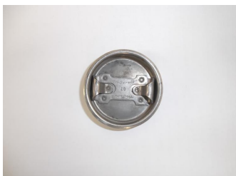
Drum Cap Stainless steel CLPL00047CLA0001