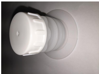
1 Inch Aseptic fill gland

Metano Limited. Units 14/15 Winfield Industrial Estate Rowlands Gill, Tyne & Wear, United Kingdom. NE39 1EH T: +44 (0) 01207 549 448 F: +44 (0) 01207 549 447 E: sales@metano.com W: www.metano.com