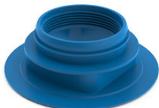
2" BSP Female Square Gland BLUE LLDPE