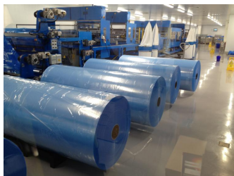
1% BLUE Tint 60mu LLDPE FILM 2200mm