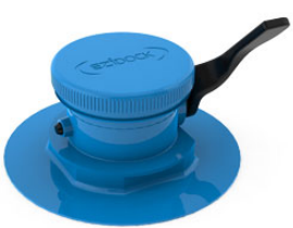
2" / S60 Disposable Butterfly Valve.

Metano Limited. Units 14/15 Winfield Industrial Estate Rowlands Gill, Tyne & Wear, United Kingdom. NE39 1EH T: +44 (0) 01207 549 448 F: +44 (0) 01207 549 447 E: sales@metano.com W: www.metano.com